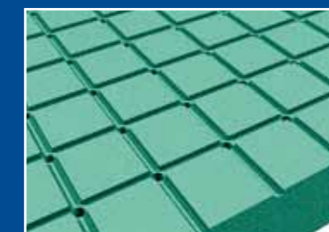
A grooved and perforated infusion DIAB core.

This is achieved by machining the core surface to produce a series of carefully positioned grooves to facilitate resin distribution. As a result the need for a sacrificial distribution net or mat (as is the case with some other infusion systems) is completely eliminated together with the requirement for peel ply and release film.