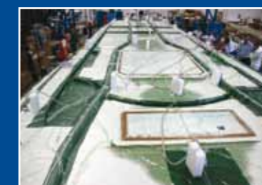
The core infusion process in progress.

The first stage of the process is to apply the gel coat in a conventional way. If desired a skin coat (a relatively thin layer of surface mats) can be applied and then cured in order to enhance the surface finish. Next dry structural reinforcements for the outer skin are positioned in the mold. Then the pre-cut and shaped DIAB Infusion Core is placed into the mold and the inner skin dry reinforcements are laid up.